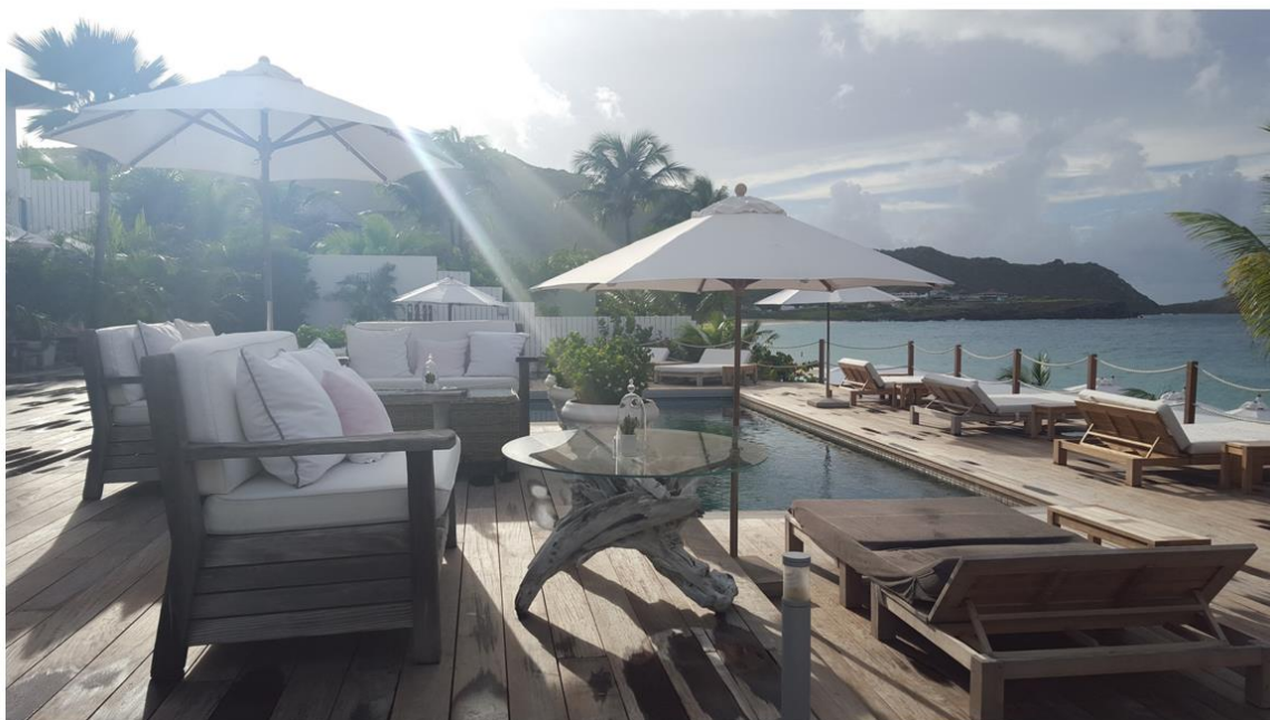
A quiet morning moment at Cheval Blanc's stunning pool.