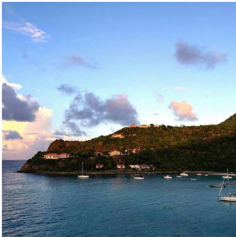
One of many magical St. Barth sunsets.