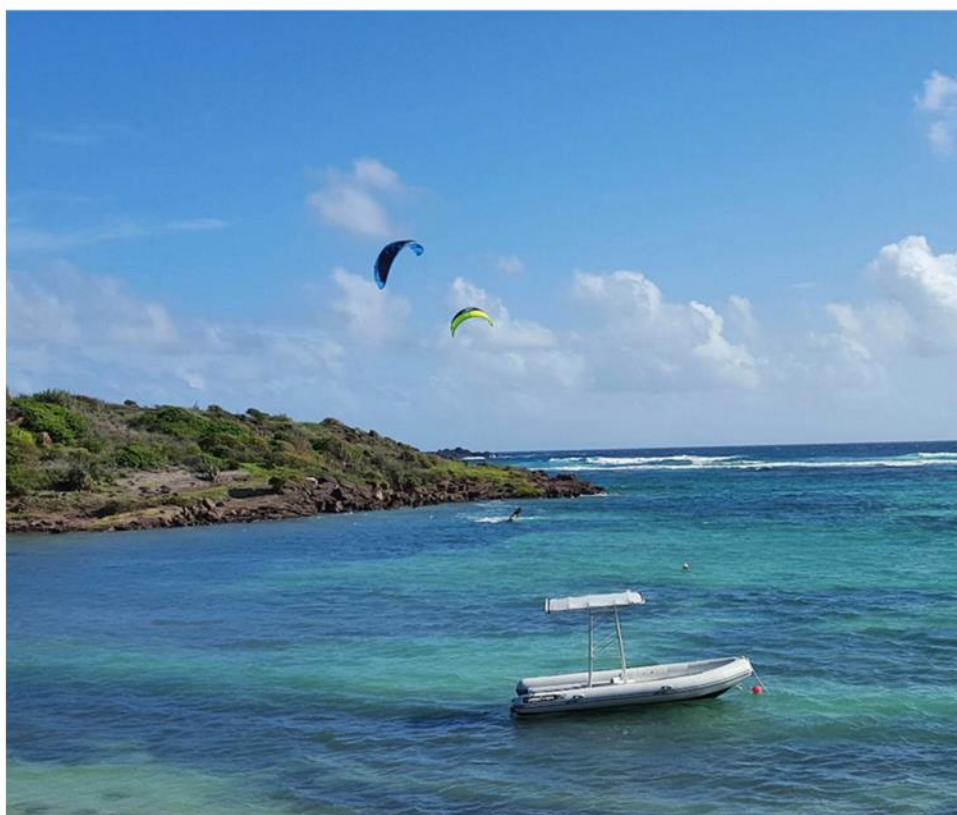
Watching the kite surfers glide along Marigot Bay.