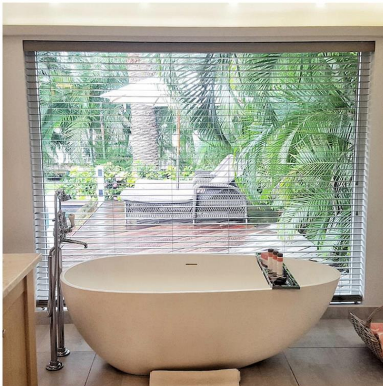
At Cheval Blanc St-Barth Isle de France, the bathtubs come with spectacular scenery.