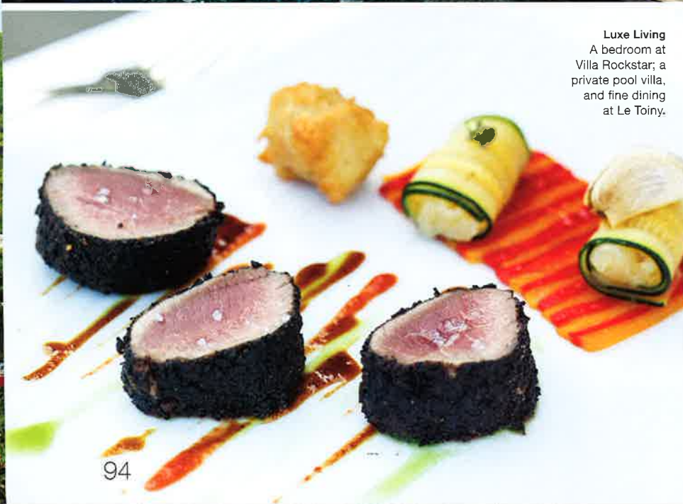
Luxe Living A bedroom at Villa Rockstar; a private pool villa, and fine dining at Le Toiny.

console used by John Lennon to record "Imagine"), and a 20-seat Cinemascope screening room.