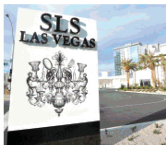
(Left) Delano Las Vegas has a 117-suite tower. (Above) SLS Las Vegas prepares to open after a $45 million renovation.